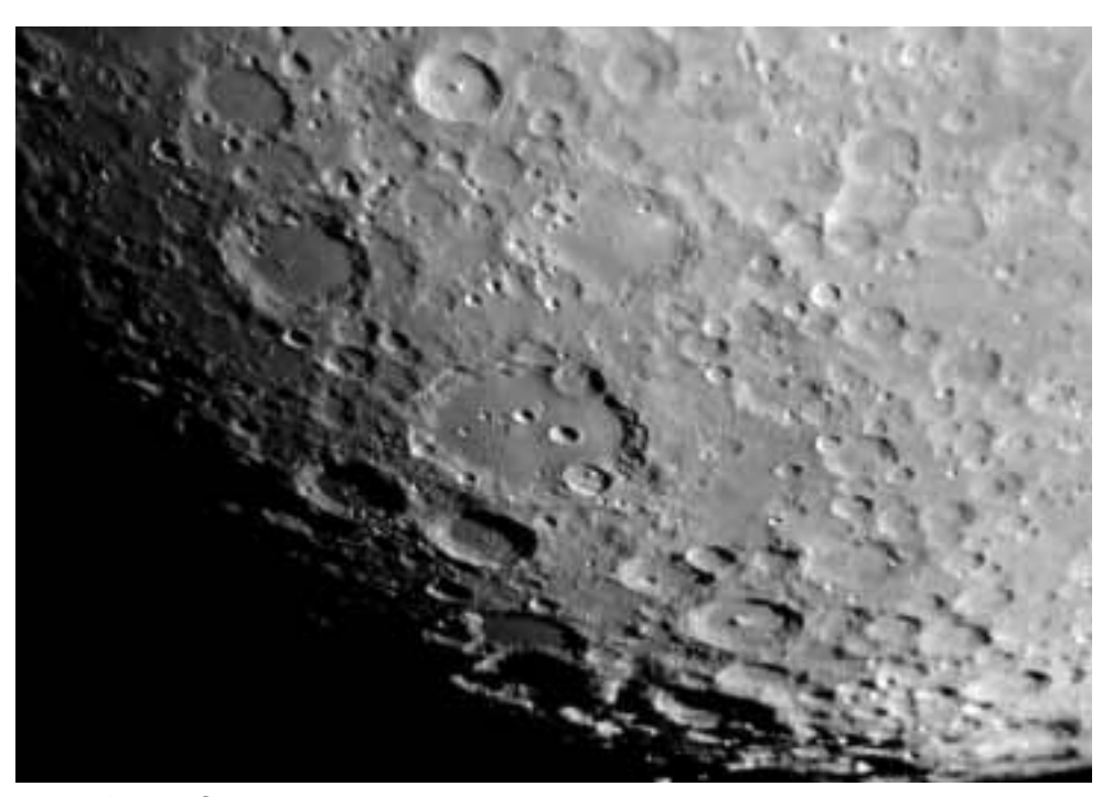
Figure 2. First Steps Into Video Astronomy: Even my early attempts with video showed the potential for this new area of amateur astronomy. The image here is a single raw video frame taken with my modified net-cam and 8-inch SCT.

One area of amateur astronomy that has actually been growing in popularity is astrophotography. The technological advances in consumer electronics that have helped distract people from astron-