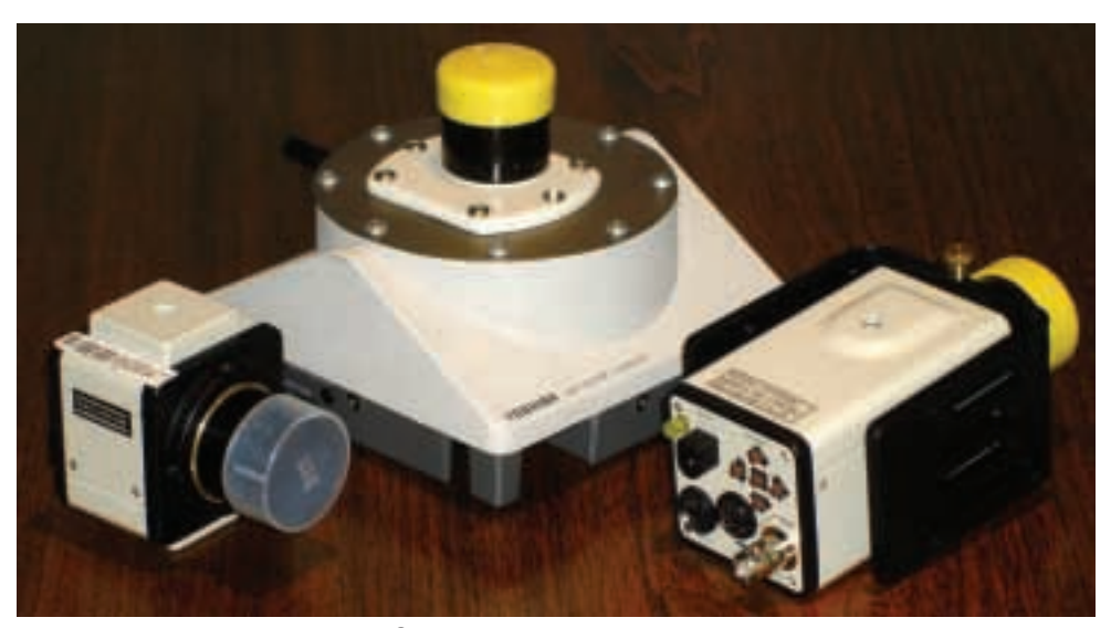
Figure 4. Author's Astro-Video Cameras: The author owns three cameras for video astronomy (from left): Mallincam Junior, Toshiba IK-WB11A net-cam, and Mallincam Xtreme.

viewing a video screen; (10) The camera uses a CCD sensor combined with sophisticated video-processing circuitry, providing high levels of sensitivity, including wavelengths not visible with the human eye; (11) Filters designed for visual and/or imaging applications can be used for effective reduction of light pollution.