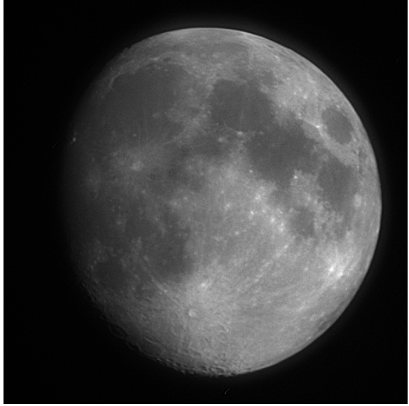
Figure 4: 850ms exposure of the Moon in CaK captured with final setup.

eclipse day (Figure 4). These preliminary tests were useful as they helped me determine that I could get a much sharper image using the lens at f/4 as oppose to its fully open position of f/2. So far things looked like my idea was going to work. I had only to deal with one remaining concern: frying my camera.