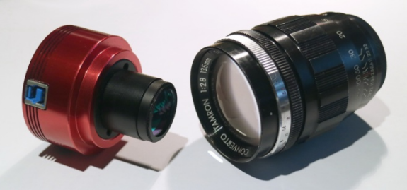
Figure 2: Image of ASI290 camera and manual 135mm Tamron lens used in imaging setup.

was that the Sun is rather boring in white light, especially considering we are in a period of low solar activity. In my experience CaK images provide a lot more detail (see Figure 1), showing not only sunspots and granulation like you would see in white light, but also active regions called plages, mega-granulation, and in some cases prominences. The solar corona is also supposed to have a large white light component which in theory stretches down into the UV part of the spectrum so it should be visible in CaK as well. Imaging the eclipse in CaK seemed to me like a good way to go. From my online research it appeared however that I was alone in my opinion. I could not find any evidence of eclipse imaging being done in CaK before, and everyone I asked told me it was a waste of time. Challenge accepted!