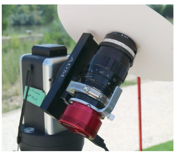
Figure 3: Eclipse day image of lens, camera, and filters on Cube Pro mount.

combination of a camera lens with large aperture setting range and a CMOS based planetary imaging camera with high sensitivity and low noise. The lens is an old 135mm manual lens made by Tamron, that has aperture settings from f/2.8 to f/22 (Figure 2). This I connected through a series of adapters to a ZWO brand ASI290 monochrome camera. My CaK filter is a 1.25" thread on style purchased from Omega Optical in Vermont, USA. The whole assembly was mounted to an iOptron Cube Pro to allow for tracking during the event (see Figure 3). The setup was very compact and light weight, which was important since our trip involved taking commercial flights as well as camping our way along in a small RV, so I needed to keep my gear case small.