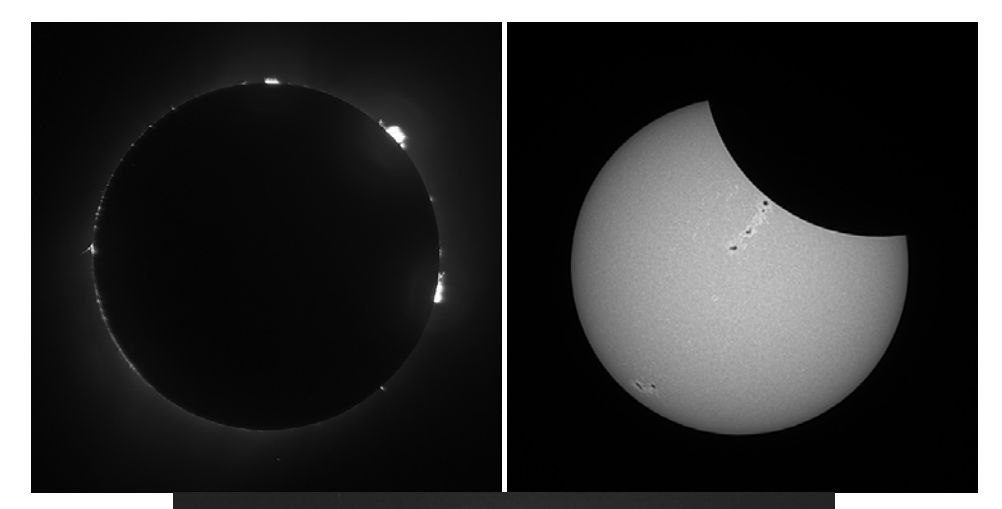
Figure 6: Solar heating test results. (table by J. Thompson)