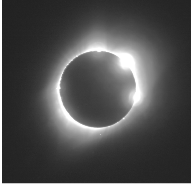
Figure 7: Images of the Sun captured in CaK during this summer's total eclipse.