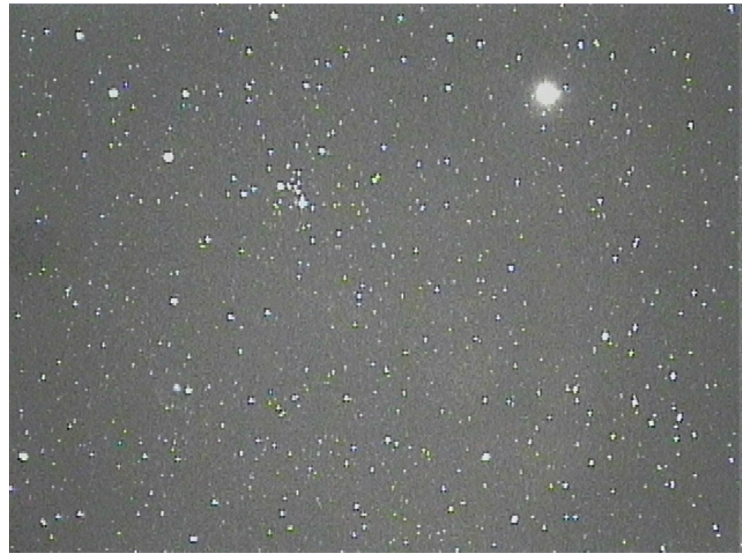
BP UV/IR Cut (9sec)