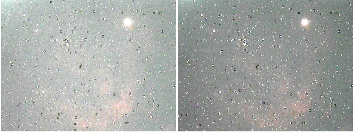
UHC + BP IR (40sec)