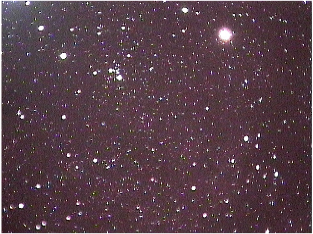
680nm Pass (40sec)

It was very clear from my short amount of testing last night that the Mallincam is able to pick up a lot of energy in the infrared band. To make it even clearer, I put my 680nm Pass filter on, allowing only infrared to get to the camera detector. Below is the resulting image...holy moly that's a lot of stars! There is no nebulousity to speak of, but that's a lot of stars. Note also how dark the background sky is. Hmmm.