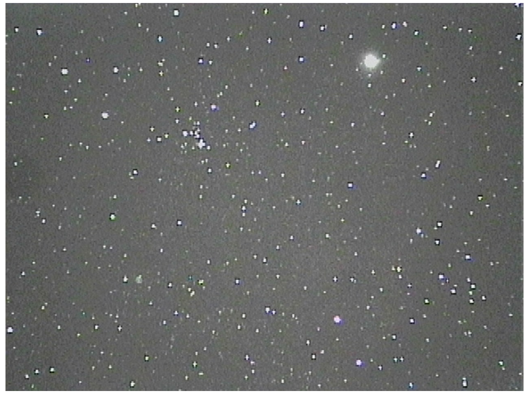
MC IR Cut (9sec)