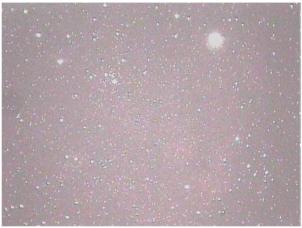
No Filter (9sec)

Note that a Moon three days past full was up during these tests, contributing to the light pollution and so making for an even more strenuous test of the filters. First I compared the view with an IR cut filter alone. From the images below you can see there is a significant reduction in star intensity as well as background brightness level when an IR cut filter is added. Only minor differences were noted between the two brands of IR cut filter tested, with the MC being perhaps slightly tighter on the brighter stars.