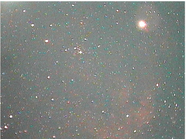
UHC + MC IR (40sec) - note TEC "ON" here