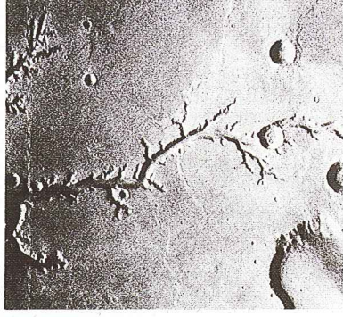
A mile-wide channel, almost certainly carved by water, scars a Martian plain that has not felt a drop of rain for billions of years. A flash flood from melted permafrost may account for this and hundreds of similar features, suggesting that Mars was once more Earthlike than it is today.

A cloud of dust stirred up by a flick of the toe would be quickly dispersed by the sharp breeze.